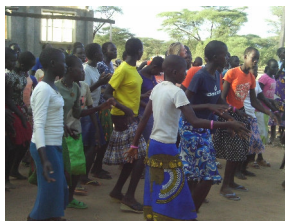
The youths registered in big number

By Tuesday 22nd, the children and youths started flocking in, in numbers from different parts of West and Central Pokot. Their huge turnout led to a delay in starting the program because of the time we spent registering the over 600 children who attended the camp on 1st day. We finally managed to put children in groups (Red, Yellow, Blue and Green) thanks for input from our able volunteers who brought in their ideas, without team work, we really wouldn't have managed to control the children.