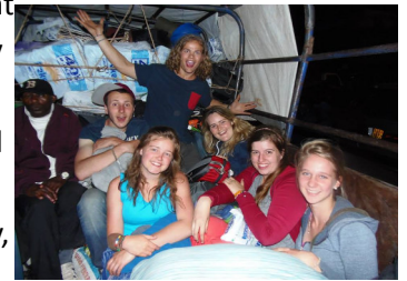
DTS students in truck on their way to Kaleshon for camp