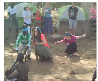
DTS Students performing skit