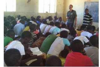
Youths motivation session

Everyday in the morning at 8 Am our program started by first the children singing and dancing Bambolela sang by famous Lukas from YWAM cambridge. The song which became the camp anthem remained forever on their lips.